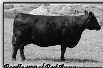
Rosetta 1100 of Best Angus