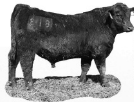
813 - Boyd New Day son

This donor dam was the high selling female in the 2009 North Dakota Select Angus Association Sale selling to Dubas Cattle Company, Nebraska.